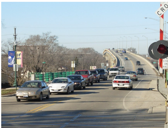
Looking West at IL Route 7 Bridge in Lockport