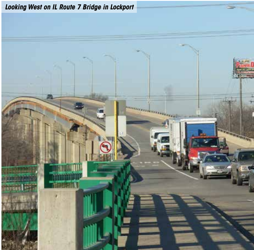
Looking West on IL Route 7 Bridge in Lockport