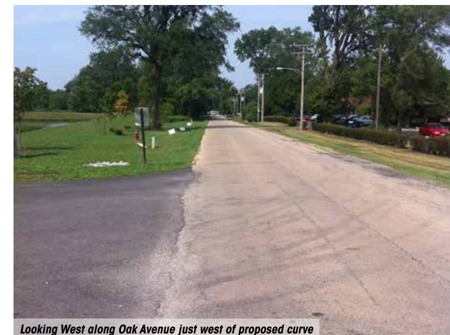
Looking West along Oak Avenue just west of proposed curve