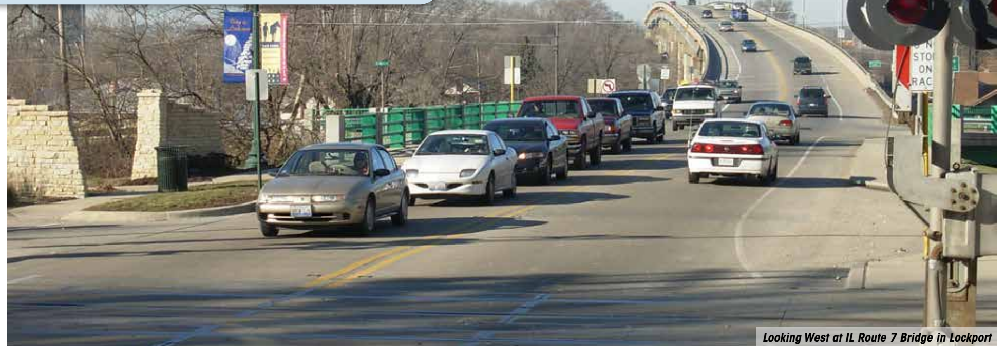
Looking West at IL Route 7 Bridge in Lockport